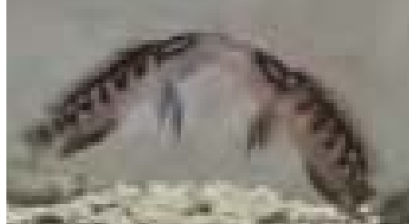
Julidochromis contending for dominance

The same research method had been used previously for mammals and birds, but it had never before been used for fish. The finding overturns our conventional wisdom about fish.